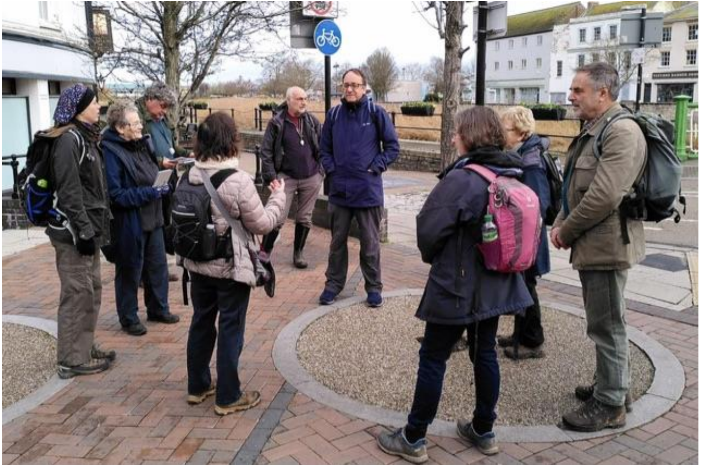
Meeting at the Town Bridge before splitting into two groups to record on either side of the Vice- County boundary.