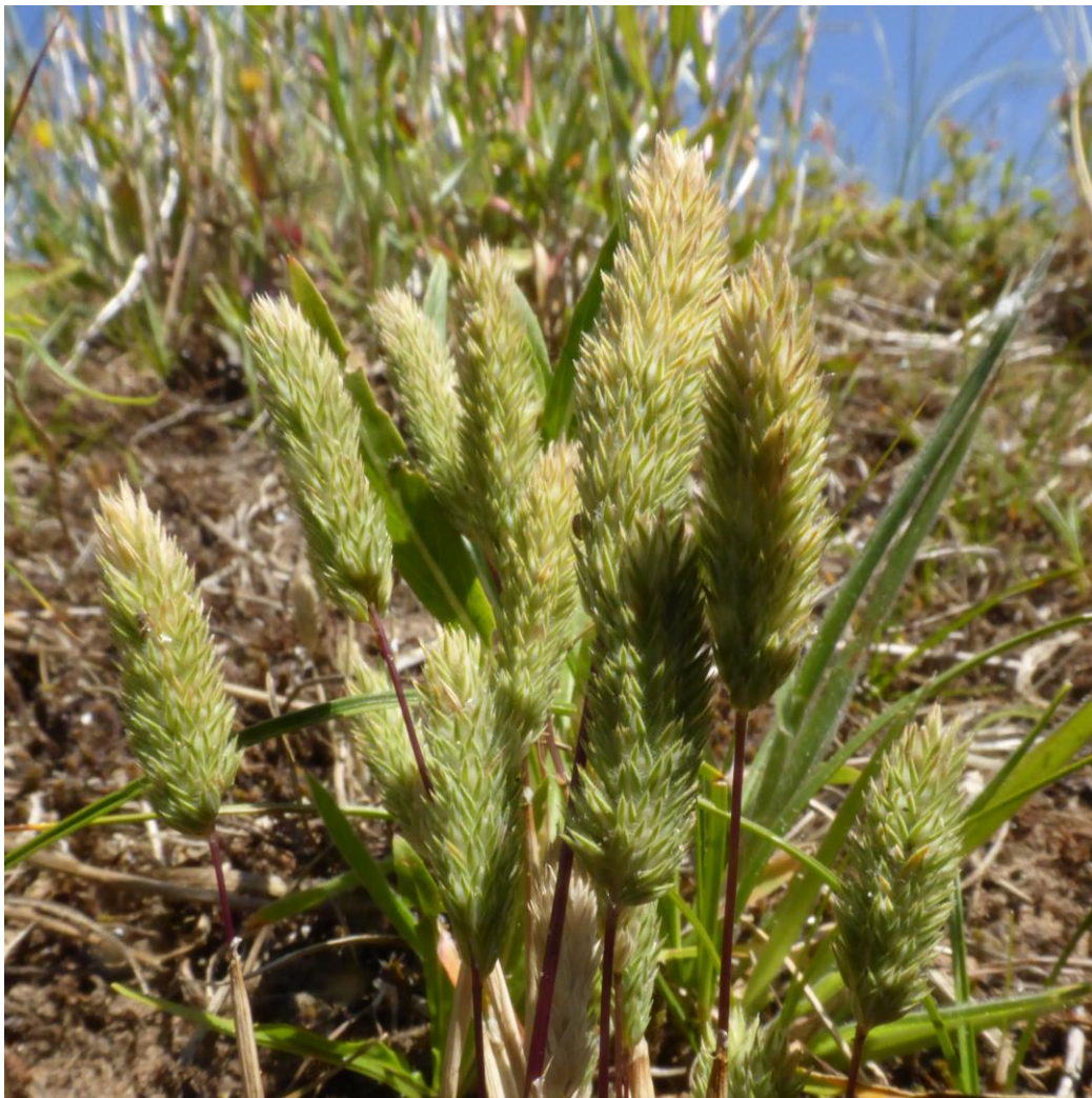
Phleum arenarium at Berrow Dunes (2014).