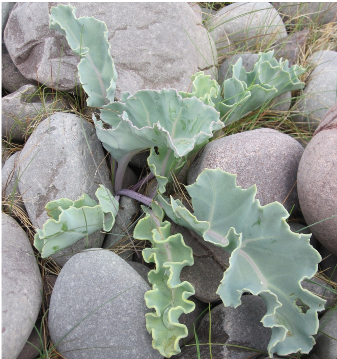
Sea Kale at Bossington