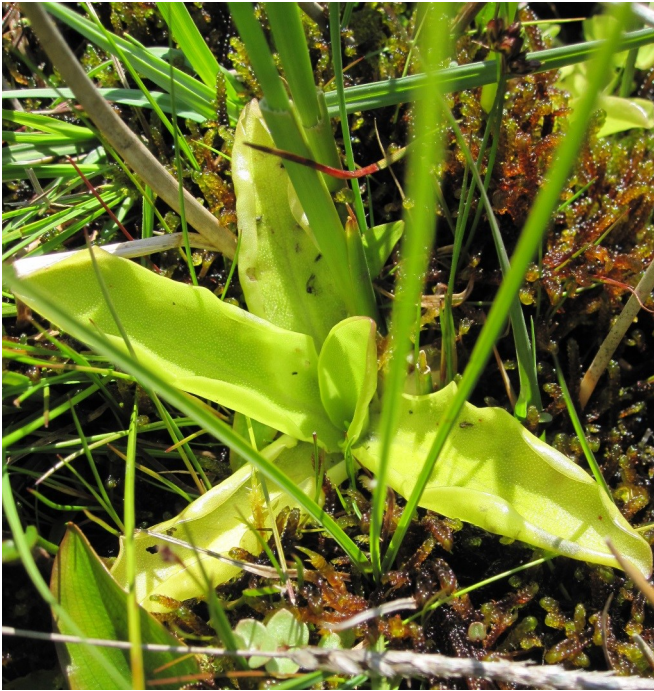
Insects on the sticky leaf surfaces of Greater Butterwort at Robbers Bridge

fore that Sorbus rupicola did grow at the Culbone site and more survey work will have to be done to see if it is still present.