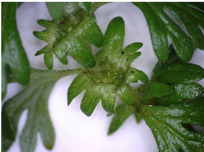
Aphanes australis showing the finger-like stipules