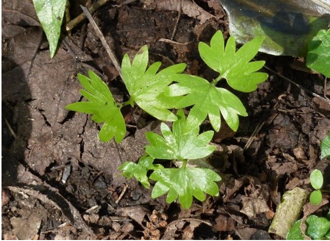
Strange finger-shaped cotyledons of Small-leaved Lime

Small-leaved Lime ( Tilia cordata ), which was just coming into leaf, is frequent here and we found masses of seedlings with their characteristic fingered cotyledons. The rarity of native Lime is partly due to the requirement for enough warmth to ripen seeds – last year was very suitable in this regard.