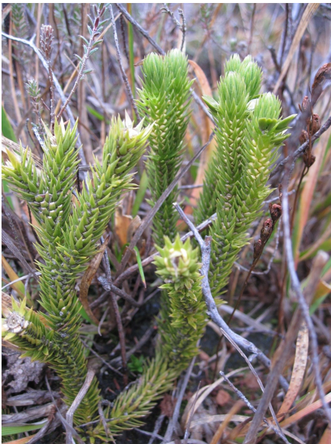
Fir Clubmoss ( Huperzia selago ssp. Selago) at Dunkery