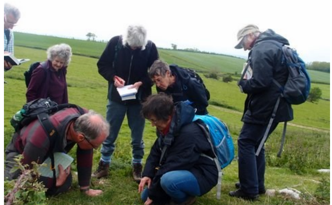
Searching the limestone grassland at Cannington Park for Spring ephemerals such as Subterranean Clover

nean Clover ( Trifolium subterraneum ), with its curious little stemless ground-level flowers ready to produce pods which bend over to drill into the ground; Small-flowered Buttercup ( Ranunculus parviflorus ) a characteristic annual of calcareous areas of coastal West Somerset; and White Horehound ( Marrubium vulgare ). All these are nationally Scarce, and the latter was a new population for this county Rare Plants Register species. A splendidly handsome alien Milk Thistle ( Silybum marianum ) is abundant here and the huge white-edged prickly rosettes made an excellent show round the stony outcrops. contrasting with tiny ephemeral species such as Rue-leaved Saxifrage ( Saxifraga tridactylites ). Various small medick and clover species, including Slender Trefoil ( Trifolium micranthum ), had everyone on their knees experiencing the demands of 'grovel turf', and an unexpected treat was finding White Bryony ( Bryonia dioica ) already in flower.