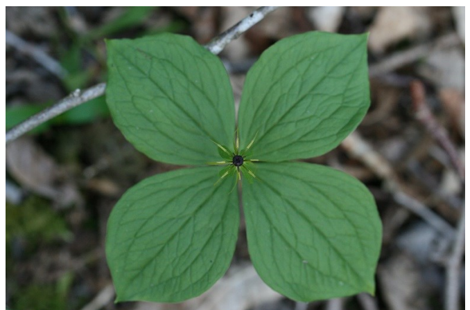
Herb Paris with its distinctive leaf arrangement

The poorly drained soils result in some of the rides being externally wet, Brookweed ( Veronica beccabunga ) had found its niche on the edge small pool created by upturned tree root, other signs of water logged soils included the extensive stand of Great Horsetail ( Equisetum telmateia ).