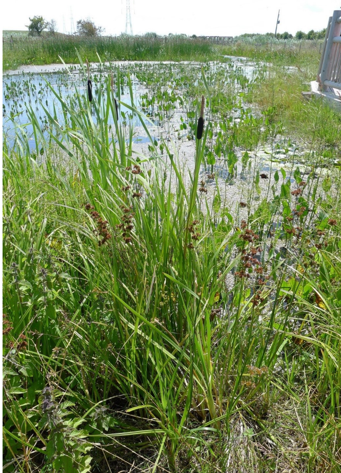
The flat-leaved Many-headed Rush Juncus polycephalus at the edge of a new pond

A little further on and we found another rush, Sea Rush ( Juncus maritimus ) – a native species, yes, and certainly not out of place here. But this is only the second record for it in VC5, and one can't help wondering whether it was brought in – maybe inadvertently – with wetland plants trucked over from East Anglia to 'speed up' colonisation of the site.