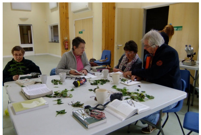
SRPG members identifying species with the aid of floras and a binocular microscope