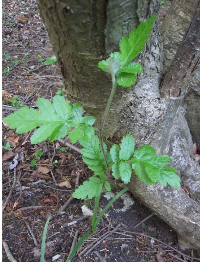
A small shoot and leaves of Sorbus x thuringiaca growing from the base of the solitary tree

elusive" whereas Swete in 1854 reckoned ' pinnatifida ' was frequent. It flowered well in 2002 and fruited copiously in 2004, the red fruits normally containing just one seed. The tree doesn't look that old, even allowing for it having two stems so the suggestion that it may have been there all along was considered unlikely.