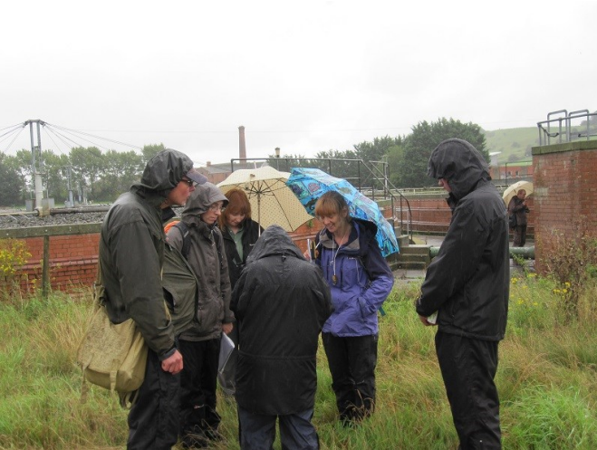
A very wet morning at Glastonbury Sewage Works—not everybody's idea of fun, but it was a botanically rich site.

Inspired by our recent workshop, records were confidently made for five willowherbs: American ( Epilobium ciliatum ), Great ( E. hirsutum ), Short-fruited ( E. obscurum ), Hoary ( E. parviflorum ) and Square-stalked ( E. tetragonum ). The site also presented a great opportunity to become familiar with four goosefoots as we found Fat-hen ( Chenopodium album ), Fig-leaved Goosefoot ( C. ficifolium ), Red Goosefoot ( C. rubrum ) and Many-seeded Goosefoot ( C. polyspermum ). We also had a mini-masterclass on distinguishing the two species of Swinecress ( Lepidium coronopus and L. didymum ). Perhaps our best records were for two native species. On bare ground we found eleven rosettes of Bugloss ( Anchusa arvensis ), which updated an Atlas Flora of Somerset record and is the first inland record for VC6 since publication of the flora. On the edge of a kerb we found Small-flowered Crane's-bill ( Geranium pu-