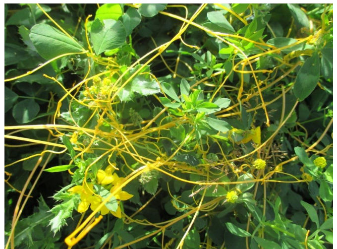
Yellow Dodder on leguminous species in seed mix strip at Knighton, Stogursey

* Cuscuta campestris (Yellow Dodder) -Knighton, Stogursey (ST19124460), 26 Aug, in seed mix strip at Bullen Farm, RFitzG, VC5. Third record for VC5.