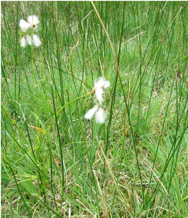
Broad-leaved Cotton-grass at Clean Moor

Clean Moor –the first part of this site visit was to an ex-arable field that had been in a restoration scheme for nearly ten years. Many of these restorations schemes seem to result in a species poor grassland of very little interest to the botanist. Here however we were very pleasantly surprised with the diversity of plants found in this field, the standout plant was Grass Vetchling ( Lathyrus nissolia ) which was so frequent it created a pink haze over large patches of the field.