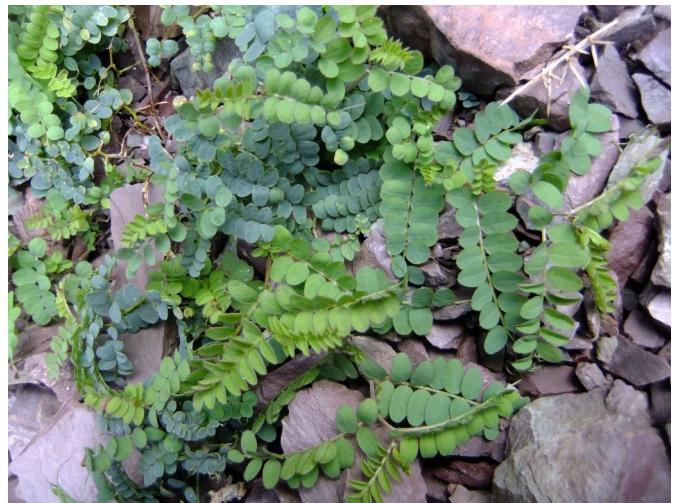
A prostrate form of Wood Vetch scrambling over cliffs and shingle near Greenaleigh Point

was a plant of Sharp-leaved Fluellen ( Kickxia elatine ) on the grave spoil of ‘Billy’, a pet dog. This is an unusual plant in the Exmoor area.