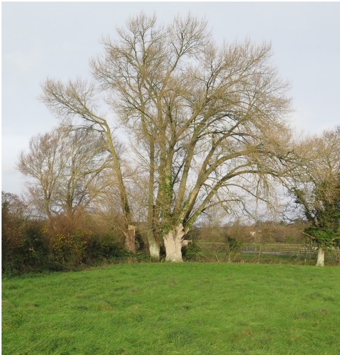
Black Poplars at Cannington, December 2015

Before I started I believed that the main constraint of how much I could do each year would be the number of locations I could get to during the flowering period. In the event however I found that, because locating trees in winter and checking their sex did not always require me to