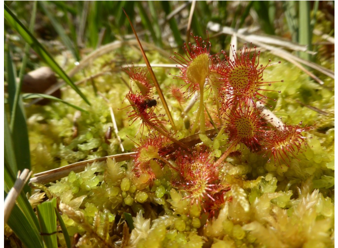
Common Sundew at Widcombe Moor

way to the west, at Haddon Hill (SS9528 and SS9628).