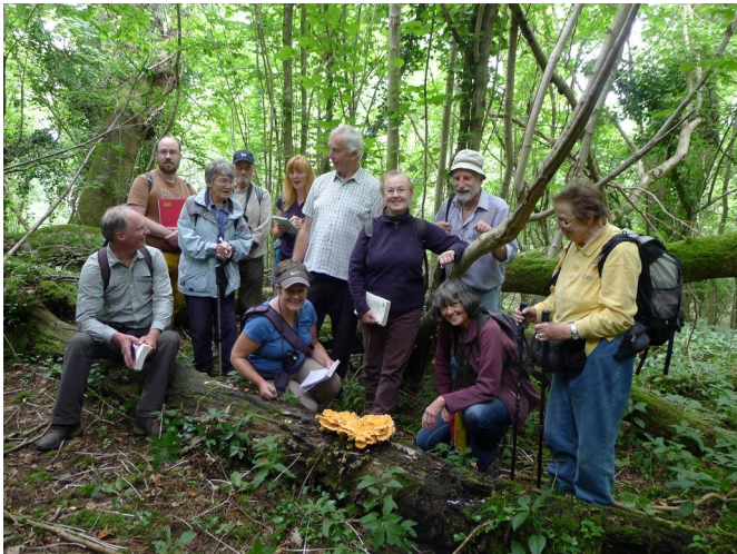
SRPG & BNS members admiring the magnificent Chicken-of-the-Woods bracket fungus in Weston Big Wood

Weston Big Wood is a large ancient woodland managed by the Avon Wildlife Trust. It is dominated by Small-leaved Lime ( Tilia cordata ) and has a rich ground flora. We climbed the steps to the top and made our way along the circular path to the north-east. Herb Paris ( Paris quadrifolia ) was recorded in two places, one patch having at least 100 plants, a few with a large single black fruit in the centre of the four or five large leaves. A group photo was taken by a splendid fungus on a decaying tree trunk, which Margarete Earle identified as Chicken of the Woods ( Laetiporus sulphureus ).