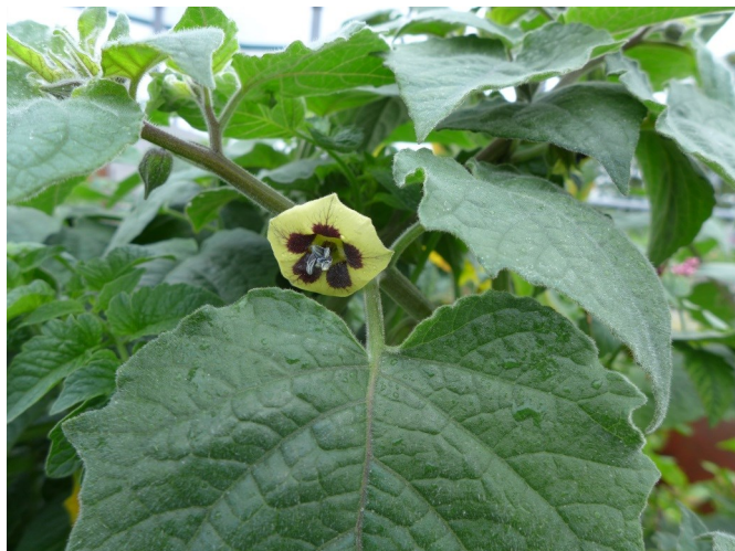
Physalis peruviana at Glastonbury Sewage Treatment Works

* Physolacca acinosa (Indian Pokeweed) – Camel Hill (ST58842570), 16 Aug, one mature fruiting plant against wall in horse paddock, outside walled garden, probably bird sown, JP, VC6. Second record for VC6 and first since AFS.