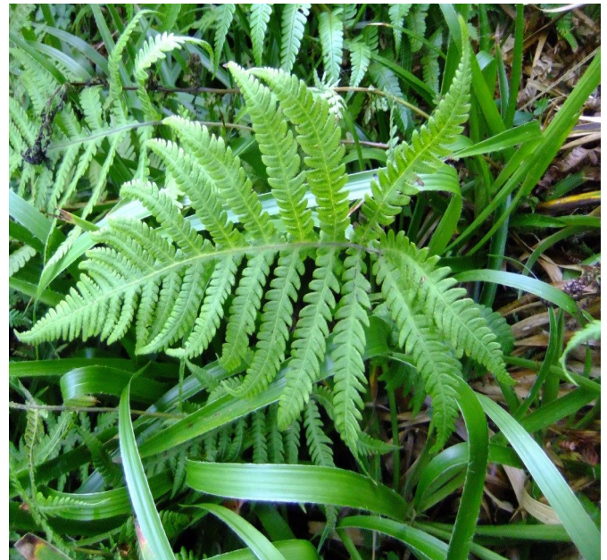
Beech Fern in Rams Combe, where about 70 fronds were counted on a steep stream side bank

of species-rich grassland with Spring Sedge ( Carex caryophyllea ), Flea Sedge ( Carex pulicaris ) and Ivy-leaved Bellflower ( Wahlenbergia hederacea ) before wading through wet, waist-high Molinia back to the path back to the cars. In total, we recorded in 4 monads and had over 80 species in each of them, with a relatively high percentage of them being of conservation concern, primarily through habitat loss.