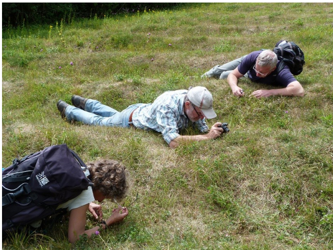
The serious business of searching for plants and then photographing them

with some aliens to start the card off. The large field alongside Tucks Brake was parched and brown so many of the expected limestone plants had already shrivelled. Dodder ( Cuscuta epithymum ) was one of the plants which we intended to monitor but it was absent where it had been previously recorded. Nit-grass ( Gastridium ventricosum ) was eventually discovered in its usual place among the short grass on the dry slope. It was very short in height and the fruits (nits) were ripe for dispersal. Also found were two species of Centaurea – Common Century ( C. erythraea ) and Lesser Century ( C. pulchellum ) but a notable absence was Grass Vetchling ( Lathyrus nissolia ) which had flowered and seeded months earlier than usual. Plenty of Dwarf Spurge ( Euphorbia exigua ) was scattered around the slopes as well as Dwarf Thistle ( Cirsium acule ) and Common Knapweed ( Centaurea nigra ) with its outer florets enlarged into a whorl as all the knapweeds in this area seem to display.