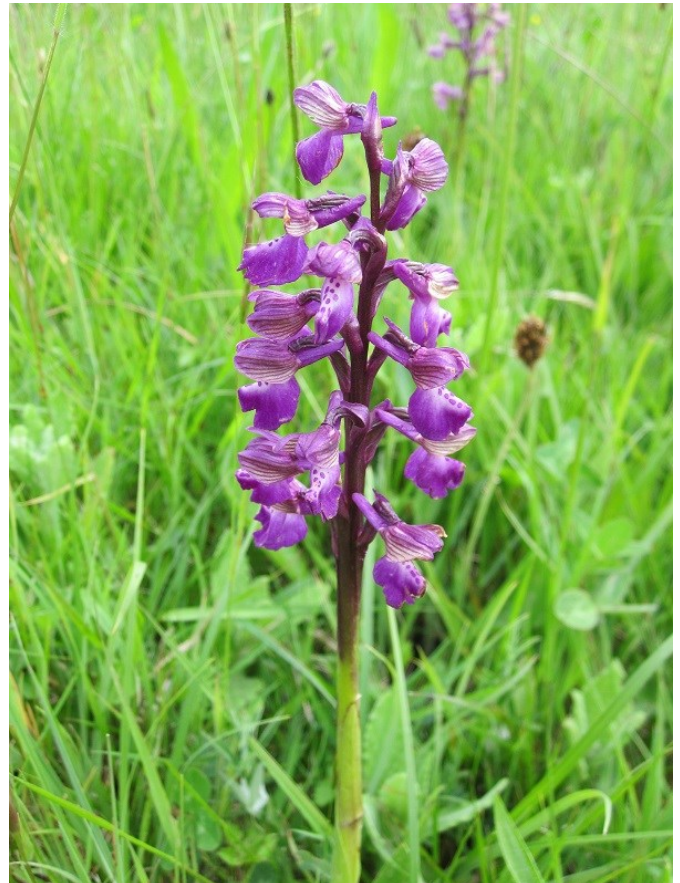
Green-winged Orchids in the species-rich grassland of Hardington Moor NNR

lens ) on the older walls together with the non-native Ivy-leaved Toadflax ( Cymbalaria muralis ), Adria Bellflower ( Campanula portenschlagiana ) and Trailing Bellflower ( Campanula poscharskyana ). As always the churchyard was one of the more interesting areas of the town. It was nice to see that the local community had built a large bug hotel in the churchyard.