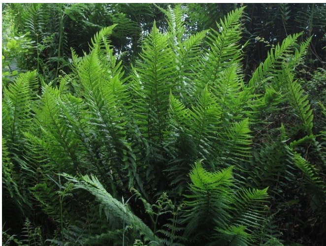
Dryopteris cambrensis at Bickham Wood

an amazing woodland with many fern species including Lady-fern ( Athyrium filix-femina ), and Broad Buckler-fern ( Dryopteris dilatata ). Large patches of Giant Horsetail ( Equisetum telmateia ) dominated the wetter area and in a few places we saw the very beautiful Wood Horsetail ( Equisetum sylvaticum ). The walking here was extremely hard going, standing still often resulted in sinking up to the knees in the wet mud. Smooth-stalked sedge ( Carex laevigata ) was found both in the woodland and the neighbouring grassland. At the end of the meeting Robin produced a large specimen of a Dryopteris affinis , this was keyed out using the British Pteridological Society "Dryopteris affinis Complex A Field Key" and was determined to be Dryopteris cambrensis . This was a really good meeting it was a pleasure to meet fellow enthusiastic botanist from Dorset but very sad we didn't find Beech Fern, our target species for the day.