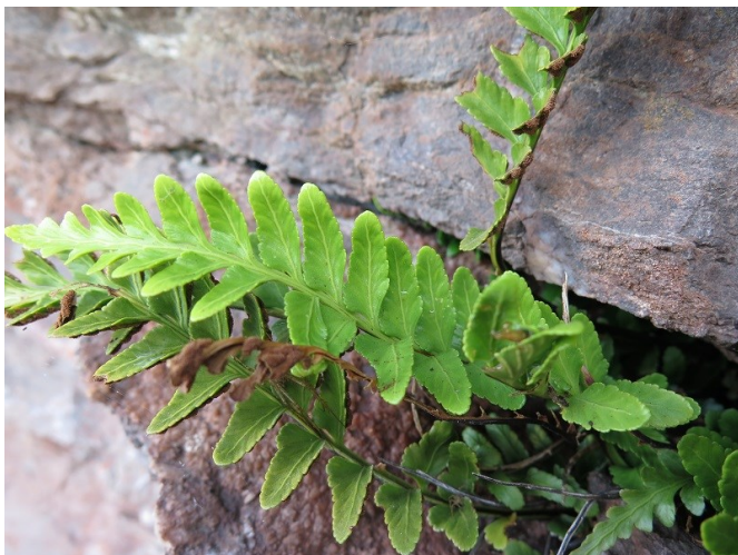
Sea Spleenwort in crevices on the cliffs west of Minehead

We took the coastal path through the woods to Greenaleigh Point and a number of us doubled back along the beach to admire 12 small trees of Sorbus subcuneata in more or less a line from the beach up the North Facing cliff. These specimens are well recorded and when I sent a picture of the bush to Dr Tim Rich, the BSBI Sorbus referee, he was able to confirm identification from a previous visit he had made. An unexpected find on a rocky outcrop just past the Somerset Whitbeam was Rock Sea Spurrey ( Spergularia rupicola ). In the Atlas of Somerset this was only recorded at Hurlstone Point, where it still persists, together with a new site at the Ivy Stone west of Porlock. This is, I understand, the third VC5 record and close to changing from “rare” category to “scarce” on the Somerset Rare Plant Register. Another rare Somerset plant is Sea Spleenwort ( Asplenium marinum ) which we found growing on cracks in Culver Cliff face.